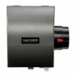
12 and 17 Gallon