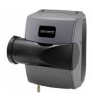
12 and 17 Gallon